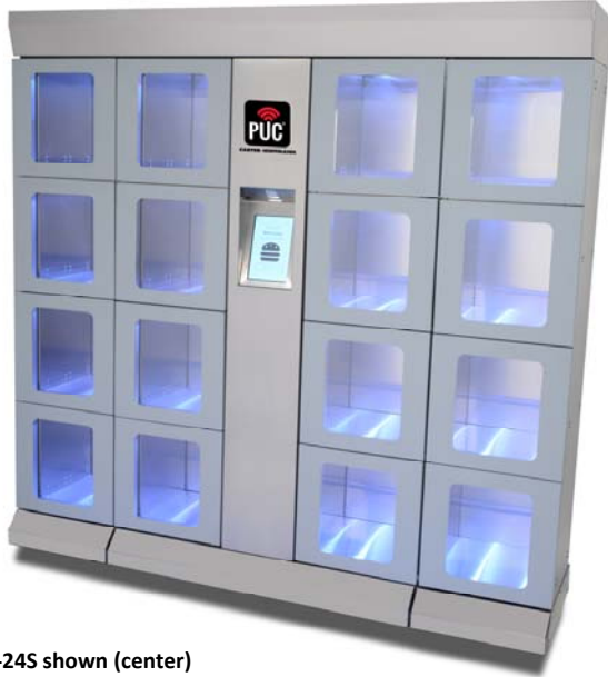
PUCH-24S shown (center) with two PUCH-14SAO add on units (left and right ends) and clear doors