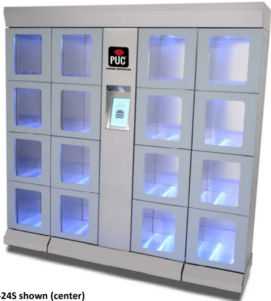
PUCH-24S shown (center) with two PUCH-14SAO add on units (left and right ends) and clear doors