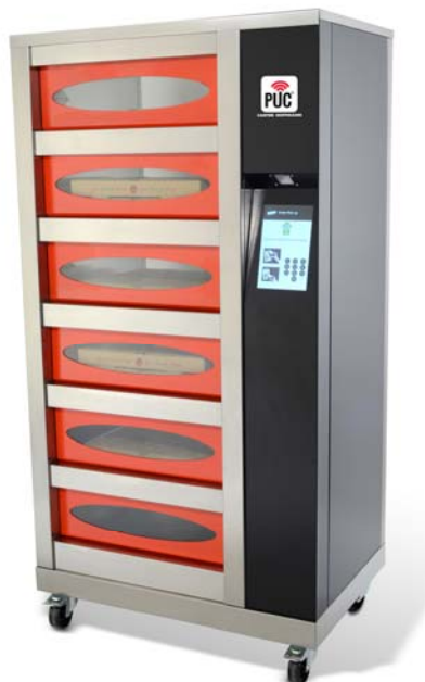
PUCH-16 (shown with custom styling)