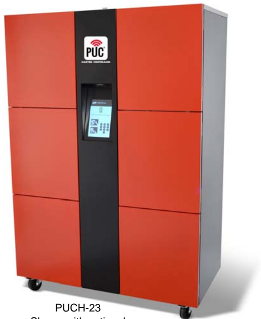
PUCH-23 Shown with optional custom colors